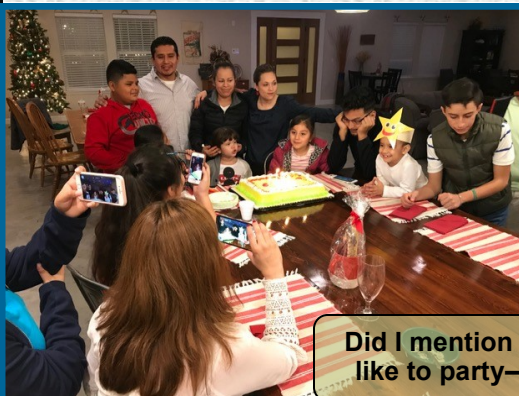
Did I mention that we like to party—a lot?