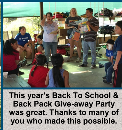
This year's Back To School & Back Pack Give-away Party was great. Thanks to many of you who made this possible.