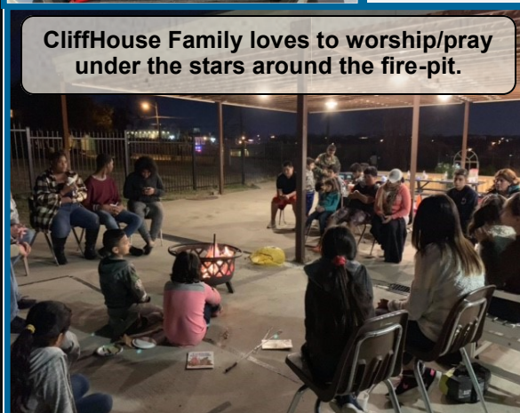
CliffHouse Family loves to worship/pray under the stars around the fire-pit.